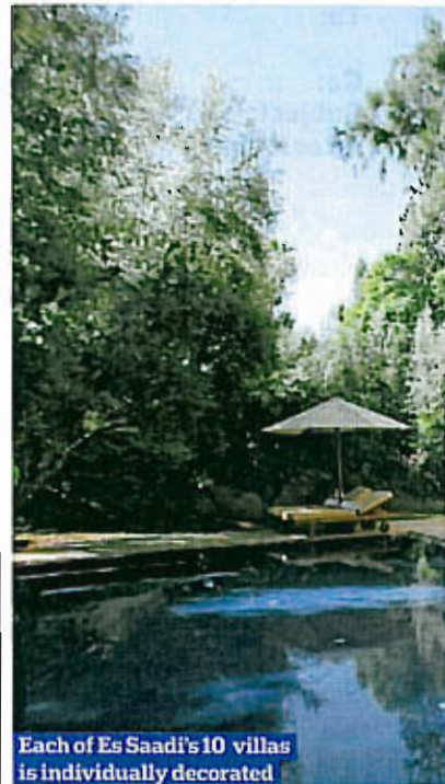
Each of Es Saadi's 10 villas is individually decorated