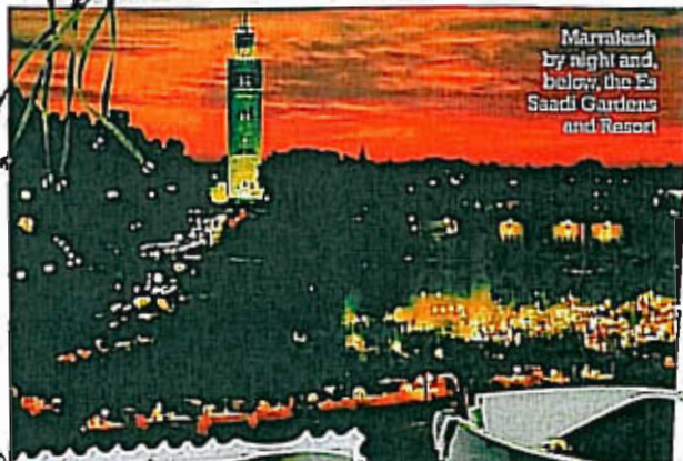
Marrakech by night and, below, the Es Saadi Gardens and Resort

Drawstring and tassel tote bag, $35 Accessorize