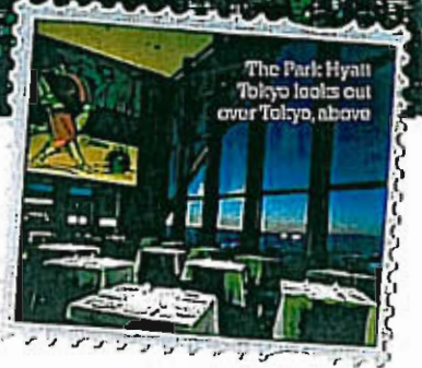
The Park Hyatt Tokyo looks out over Tokyo, above

Known for its exciting nightlife, Japan's capital also provides oases of calm, such the Imperial Palace's beautiful gardens, where you can recover from all that wedding planning. Shopaholics should go to Ginza for designer treats or stock up on the latest technology at Akihabara. Visits to a sumo tournament or Tokyo's DisneySea water park are perfect for two. Park Hyatt Tokyo offers a spa, indoor pool and stunning views from its jazz bar ( tokyo.park.hyatt.com ; from £250 per night). STAR ATTRACTION Head to Ueno Park, home to museums, galleries and the national zoo (with an adorable family of giant pandas).